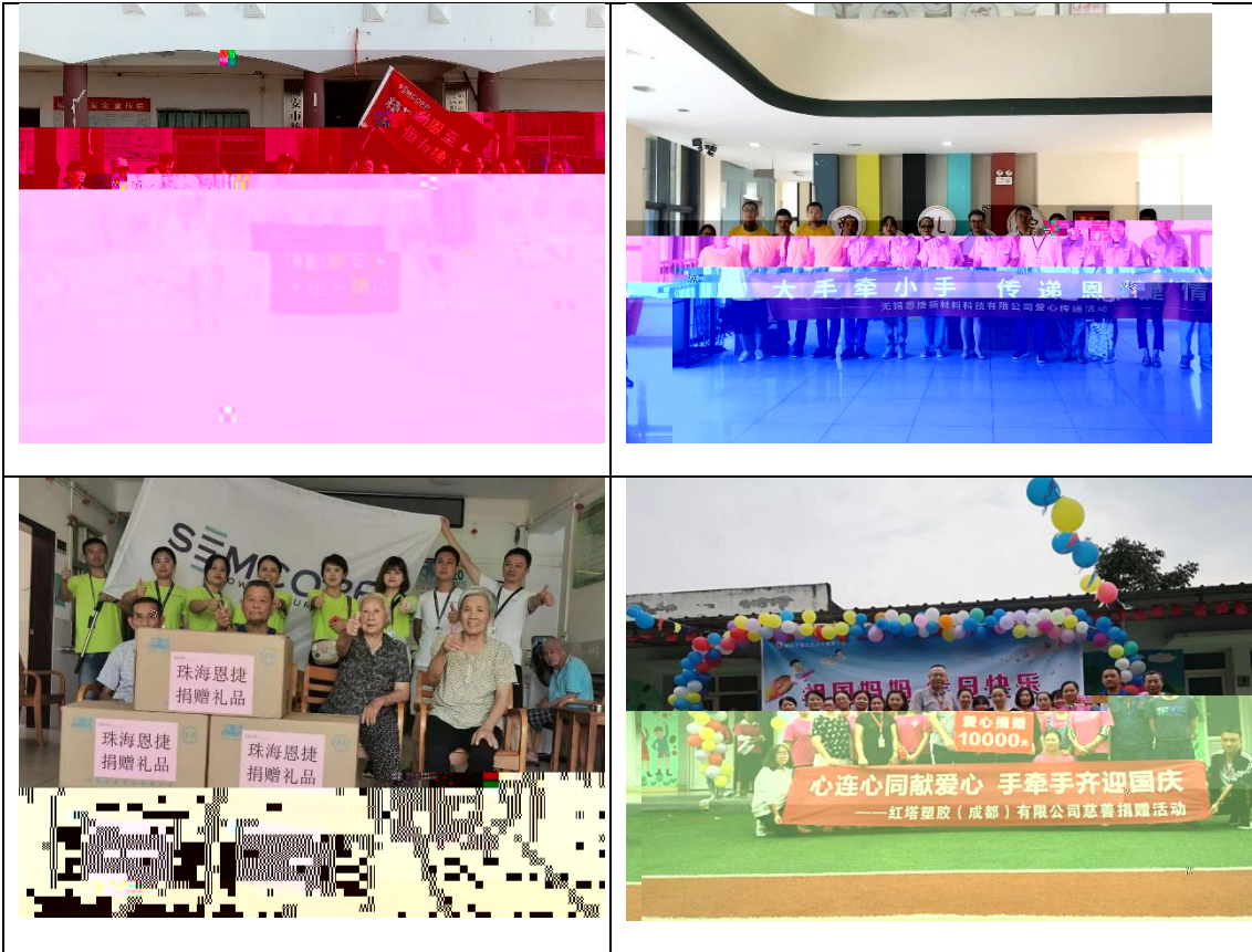
Staff members across China participate in various initiatives.

19 pandemic, we still did our best and conducted various initiatives at the subsidiary level in 2020. For example, Zhuhai Energy organized employees to send warmth to nursing homes and needy families in September.