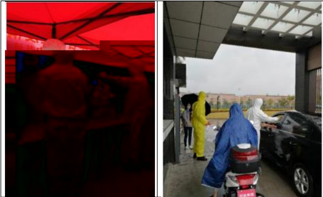
Drivers and pedestrians had their temperature checked before the entrance to the

taking the shuttle bus were required to have their temperature checked one by one, disinfect their hands and register their temperature; the G were fully disinfected after they are used.