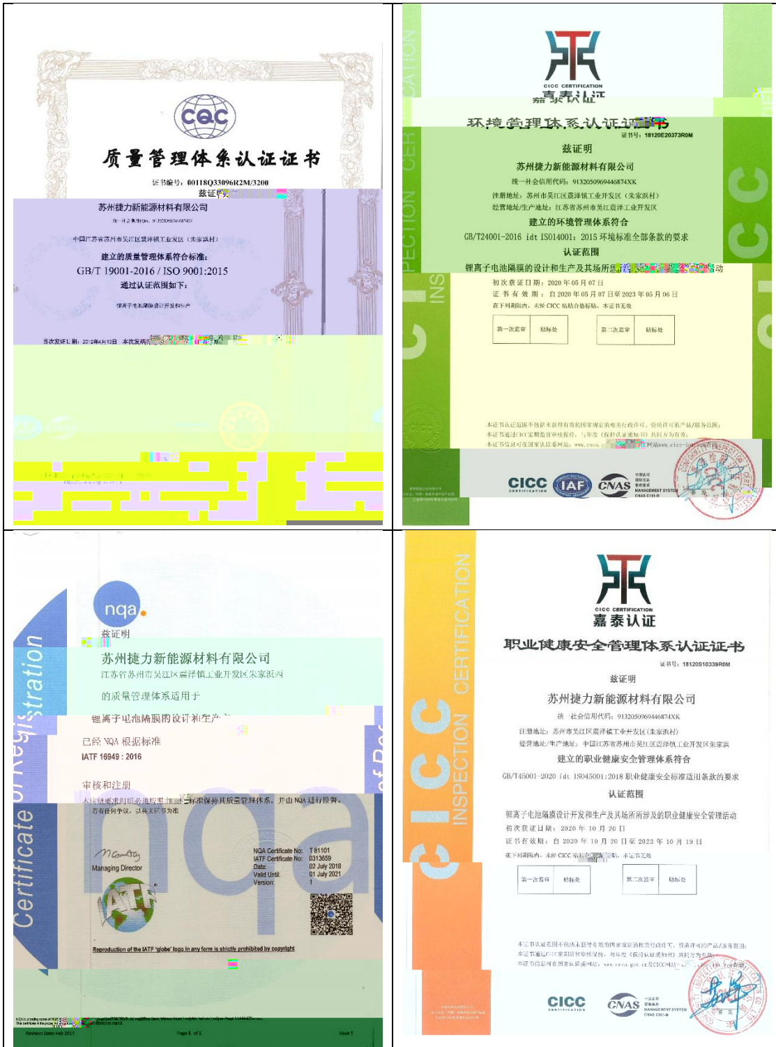
The above pictures show those system certificates obtained (Suzhou Jieli as an example)

In accordance with laws and regulations as well as system management requirements, we have set up a stringent product quality assurance process to ensure the quality of our products. The Quality Management Department of each factory is responsible for recording self-inspection and self-audit steps on a daily basis and providing analysis reports on eight dimensions, namely team formation, background description, corrective measures, cause analysis, improvement measures, verification of the effects of improvement measures, prevention of