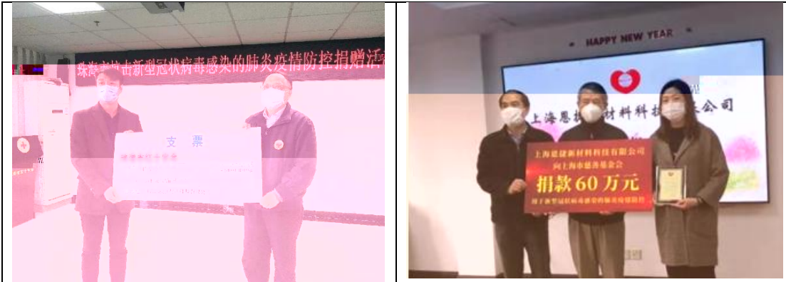
We quickly responded to COVID-19 outbreak and made an initial donation of funds and goods in our subsidiaries across China.

Over the years, we have joined or organised employees to participate in a wide range of community service programmes for the well-being of local communities, and our efforts have been widely recognised. For example, Hongta Plastics (Chengdu)